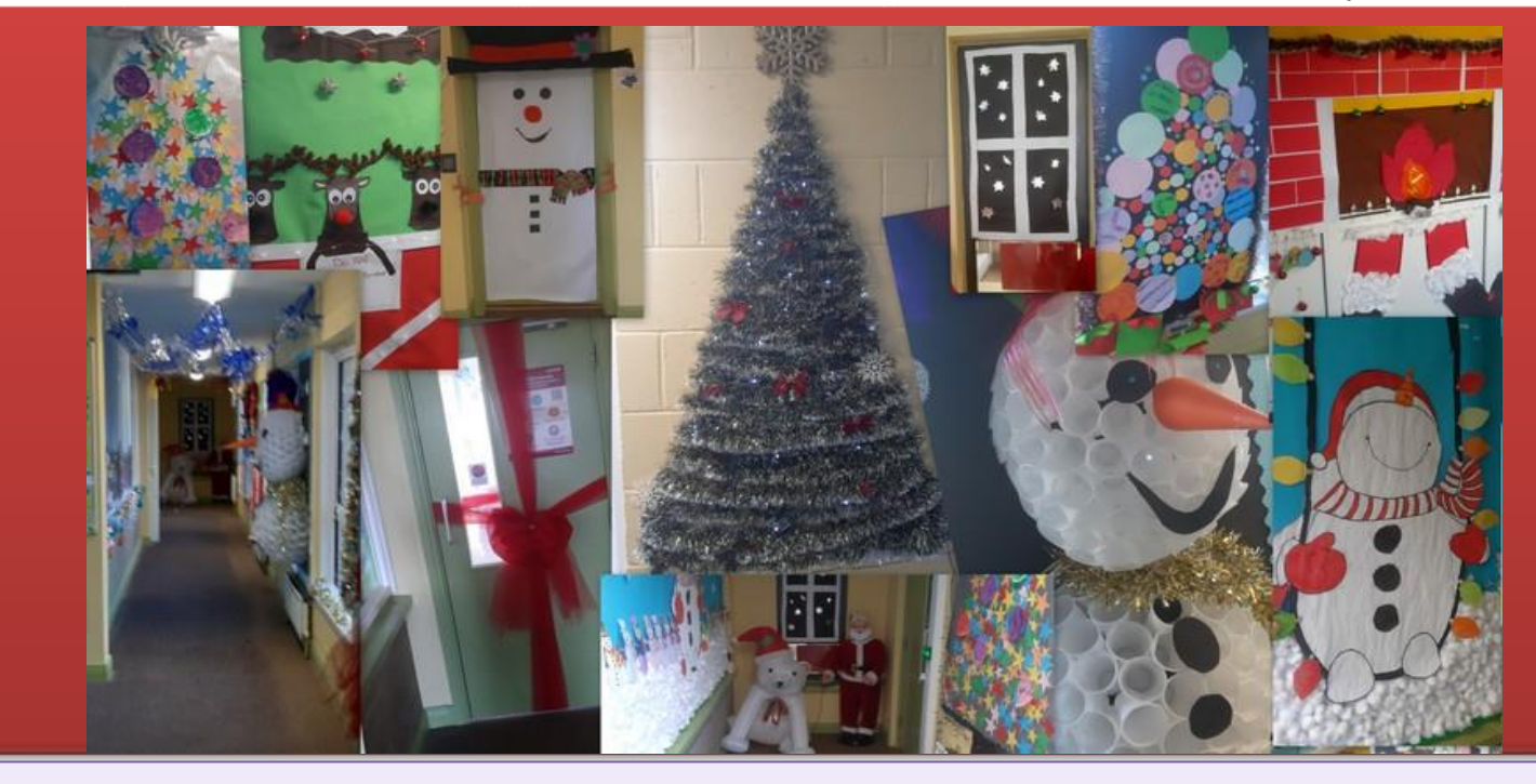
'Junior infants have been busy with their Christmas and winter art. Well done!'

Congratulations to our Cairde Team, for winning a prize in Navan Education Centre school competition for their Winter Wonderland Christmas Art Display! Your creativity and festive spirit truly shone through your beautiful artwork. It is a well-deserved victory that reflects the talent and effort each of you put into making the holiday season brighter for everyone. Bravo on a job well done!