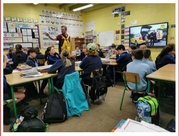
Dogs Trust Workshop 2023